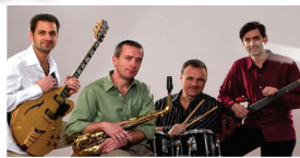
Regional Jazz Favorites E.S.P. 2pm - 5pm

Over twenty Upstate New York wineries are scheduled to offer tasting & sales amidst a backdrop of FREE live jazz entertainment!